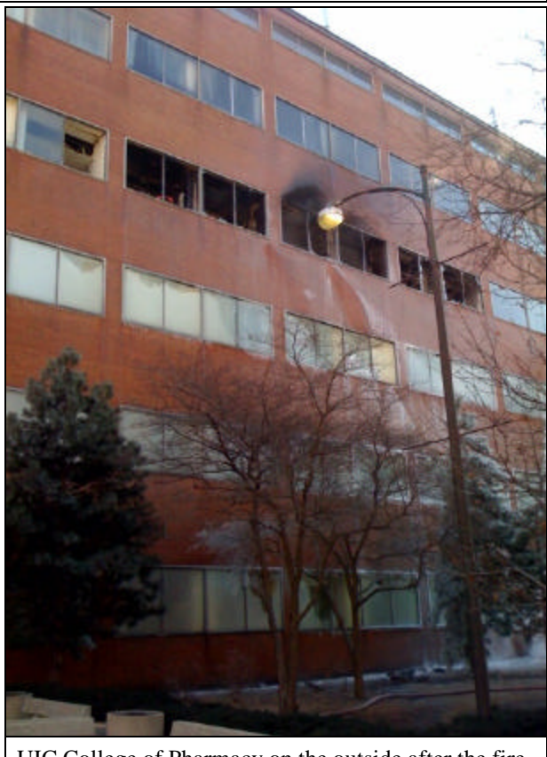
UIC College of Pharmacy on the outside after the fire.

To donate, copy and paste the link below into your web browser: http://www.pdc-chicago.org/membership.htm