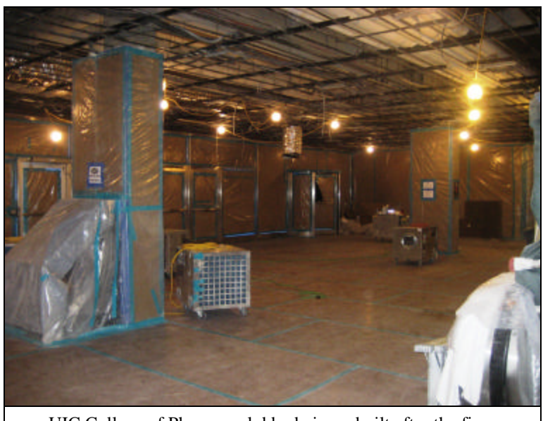
UIC College of Pharmacy lobby being rebuilt after the fire.